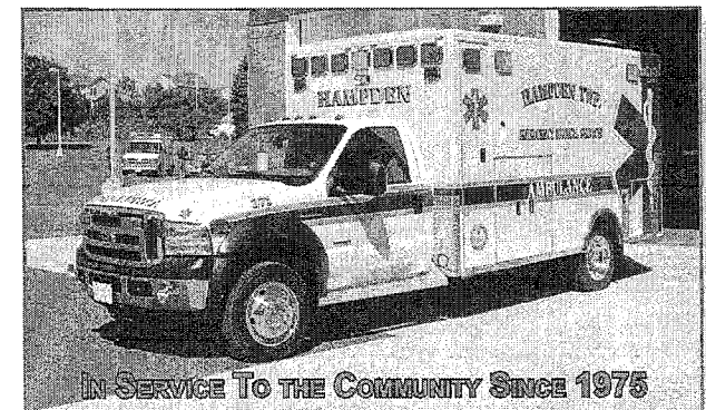
IN SERVICE TO THE COMMUNITY SINCE 1975